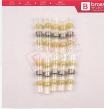
BHC503 10 Pieces Heat Shrinkable Crimp Solder Sleeves Butt Connectors for 40 60 mm 2 Cable Transparent Yellow. Length 39 mm