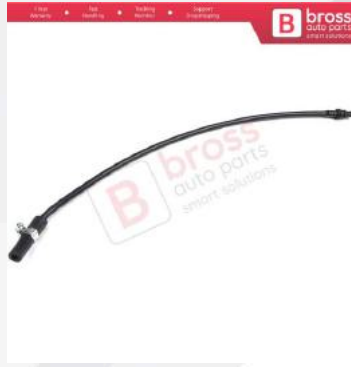
BHC661 Engine Coolant Overflow Hose Vent Tube Breather Pipe 2115010225 for Mercedes E Class W211 OM646 Engine