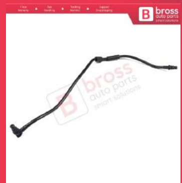
BHC663 Engine Coolant Overflow Hose Vent Tube Breather Pipe 2115011625 for Mercedes W211 E63 AMG C219 CLS63 AMG M156 6.2 L Engine