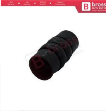
BHC650 Turbo Charger Intake Air Hose 5T166N650AB for Ford Connect Fiesta Focus Turnier