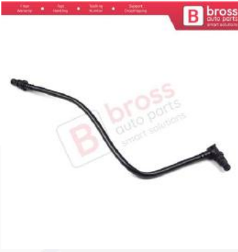
BHC660 Engine Coolant Overflow Hose Vent Tube Breather Pipe 2115010925 for Mercedes W211 C219 S211