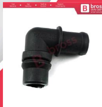
BHC655 HVAC Air Conditioner Heater Hose Connector 2038300596 for Mercedes W203 A203 C203 CL203 CLK203