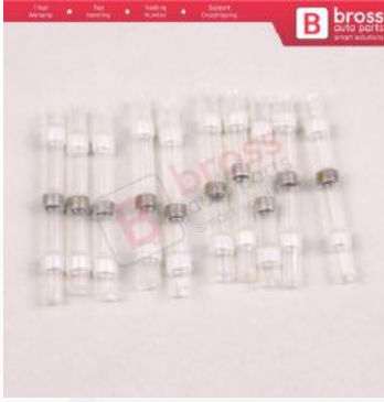
BHC500 10 Pieces Heat Shrinkable Crimp Solder Sleeves Butt Connectors for 01 05 mm 2 Cable Transparent White Length 24 mm