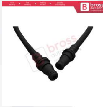
BHC634 Engine Coolant Recovery Tank Breather Pipe 2115010625 for Mercedes E320 E350 E280 Length 545 mm