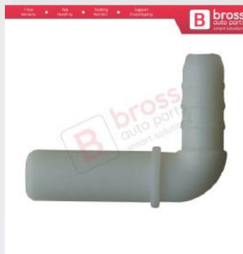
BHC652 Brake Booster Line 2034305129 Repair Part for Mercedes C Class W203 S203 CLK C209 A209