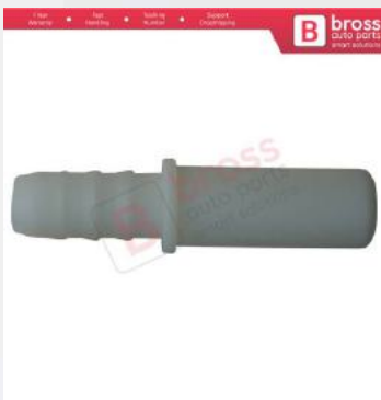
BHC651 Brake Booster Vacuum Hose 2024304629 Repair Part for Mercedes C W202 CLK430