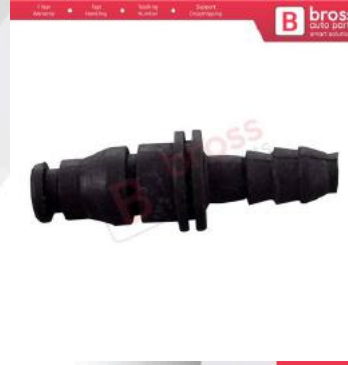
BHC633 Universal Expansion Tank Coolant Hose Connector