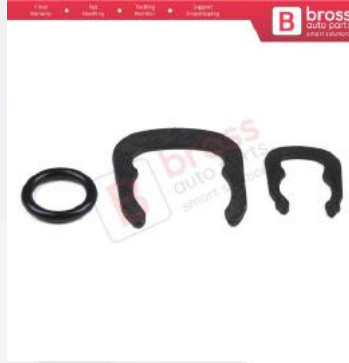
BHC659 Thermostat Temperature Sensor Seal Liner Coolant Hose Retaining Spring 032121142A for VW Audi Seat Skoda