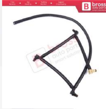
BHC666 Fuel Line Tube Assy Overflow Return Pipe Hose for Ford Fiesta MK5 MK6 Fusion 1.4TDCi F6JA F6JB 2S6Q9K022BD