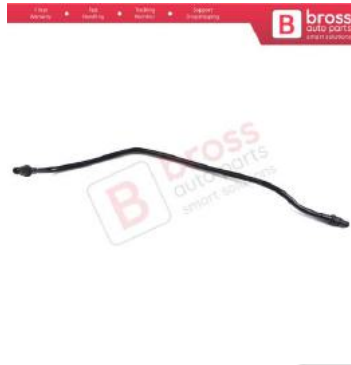
BHC662 Engine Coolant Overflow Hose Vent Tube Breather Pipe 2115010125 for Mercedes W211 E 500 C219 CLS 500 M113.967 Engine