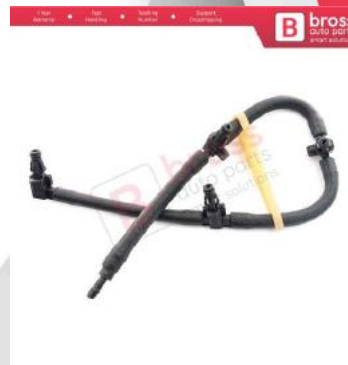
BHC640 Injector Fuel Leak Off Line Pipe 6510702432 for Mercedes Sprinter Vito Viano W639