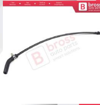
BHC665 Engine Coolant Overflow Hose Vent Tube Breather Pipe 2115011525 for Mercedes E Class W211 E320 E280 OM648 Engine 3.2 D