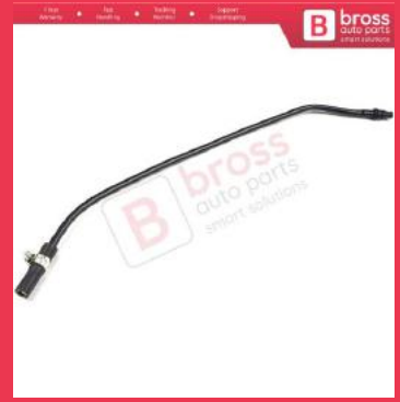
BHC664 Engine Coolant Overflow Hose Vent Tube Breather Pipe 2115011525 for Mercedes E Class W211 OM646 2.1 D