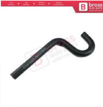
BHC22 Radiator Overflow Fitting Engine Coolant Water Line Pipe Hose 17111712329 for BMW