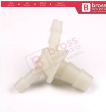
BHC658 Cylinder Crankcase Oil Breathing Pressure Reducing Valve Connector 1110180009 for Mercedes Ssang Yong