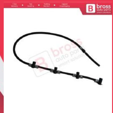
BHC649 Fuel Overflow Hose A6460700932 for Mercedes Sprinter 2.2 CDI