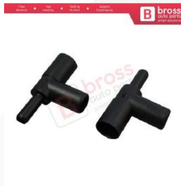
BHC642 2 Pieces Carburetor Distribution 3 Way Hose 7705030125 for Renault 9 11