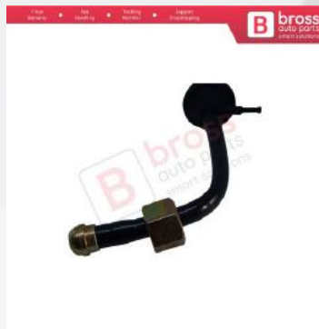
BHC646 Brake Booster Valve With Hose 564609 90497004 For Opel Vauxhall Vectra B 2.0