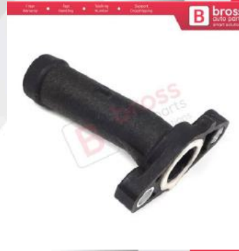
BHC657 Engine Coolant Water Flange Socket 03H121145A for Audi Q7 VW EOS CC Passat Touareg Porsche Cayenne Skoda Superb