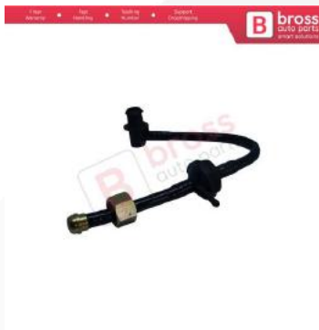
BHC645 Brake Booster Valve With Hose 564611 90498464 For Opel Vauxhall