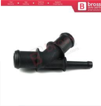
BHC654 Engine Coolant Tee Distributor Hose Connector Water Flange Connection 1J0121087D for VW Audi Seat Skoda