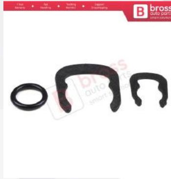
BHC659 Thermostat Temperature Sensor Seal Liner Coolant Hose Retaining Spring 032121142A for VW Audi Seat Skoda