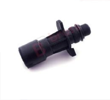
BHC653 Engine Oil Cooler Line Inlet Connector Tube Hose LR028136 for Land Rover Sport LR4 Range Rover