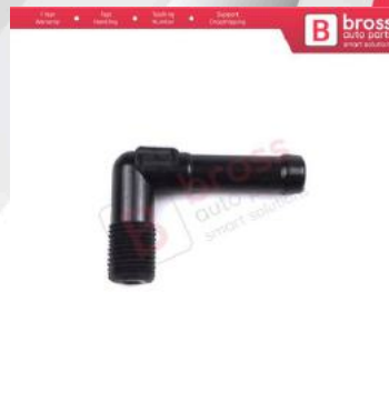
BHC647 Thermostat Pipe 1338331R for Opel Vauxhall Astra G Vectra B Zafira A 1.4-1.6 16V