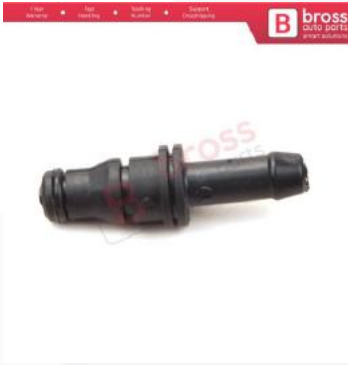
BHC632 Coolant Breather Hose Pipe Socket A0039970689 for Mercedes W203 W221 C230 S400 S550 S600