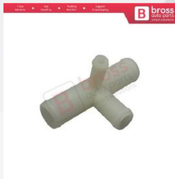
BHC643 Coolant Flange 4 Way Hose 7705030158 for Renault 11 21 9