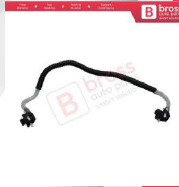
BHC635 Diesel Fuel Line Pipe 6110702032 From Filter To Pump for Mercedes Benz Sprinter Vito