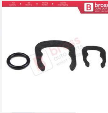
BHC654 Engine Coolant Tee Distributor Hose Connector Water Flange Connection 1J0121087D for VW Audi Seat Skoda