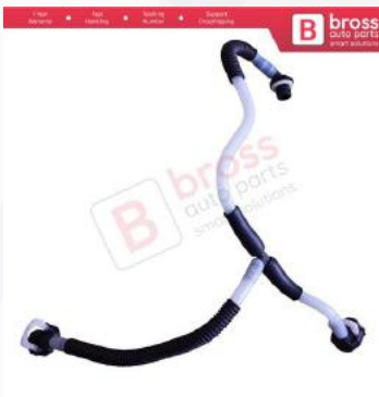
BHC637 3 Way Fuel Pipe to Pump 6110707632 for Mercedes Benz Sprinter Diesel 2000-2006