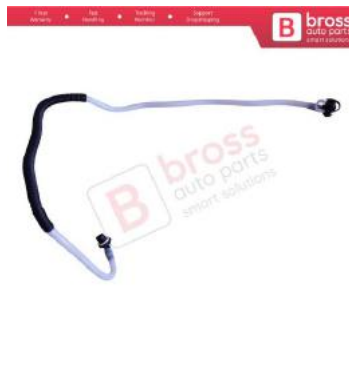
BHC638 Diesel Engine Fuel Hose Pipe Line 6110702932 for Mercedes C E V Class Sprinter Vito 638