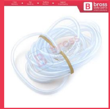
BHC644 3 Meters Windscreen Washer Jet Hose Tube Screen Water Pump 4mm Hose Pipe