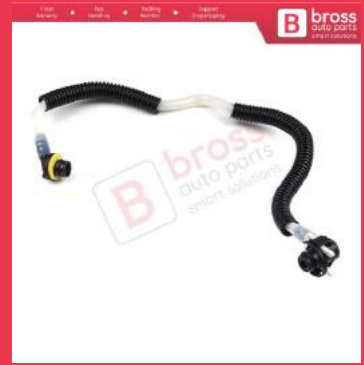
BHC636 Diesel Fuel Line Pipe A6110706832 From Filter To Pump for Mercedes Benz Sprinter Vito